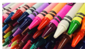
SEND Local Offer