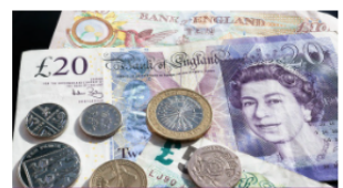
Housing and finances

The Online Family Hub has been developed to provide you with a range of different types of resources that are available to you online, on the phone or face to face that you can access directly.